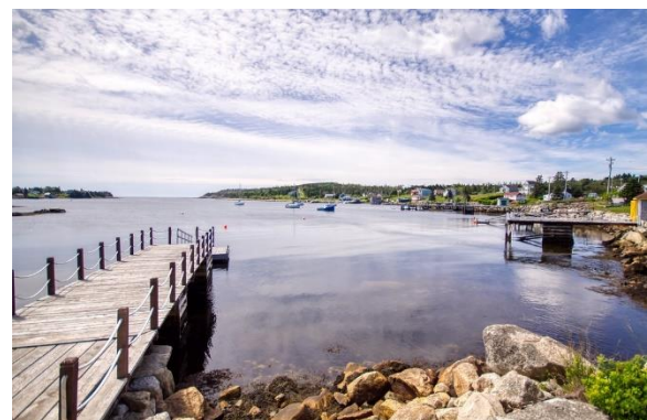
Ketch Harbour looking out to sea. Photo by Earl Hickey (©).

Ketch Harbour green light buoy Fl G (HE19) was laid in 1961 about 0.5 NM seaward. The buoy marks the approaches to a fishing place called “Nemagakunuk.” Early settlers called it Catch Harbour. The name first appeared on the 1766 chart of Capt James Cook, RN.