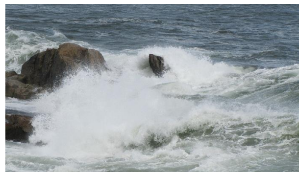
The fury of Hurricane Earl, rocky coast, west of Mars Rock, September 2010.