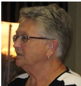
Commander's Corner April, 2012