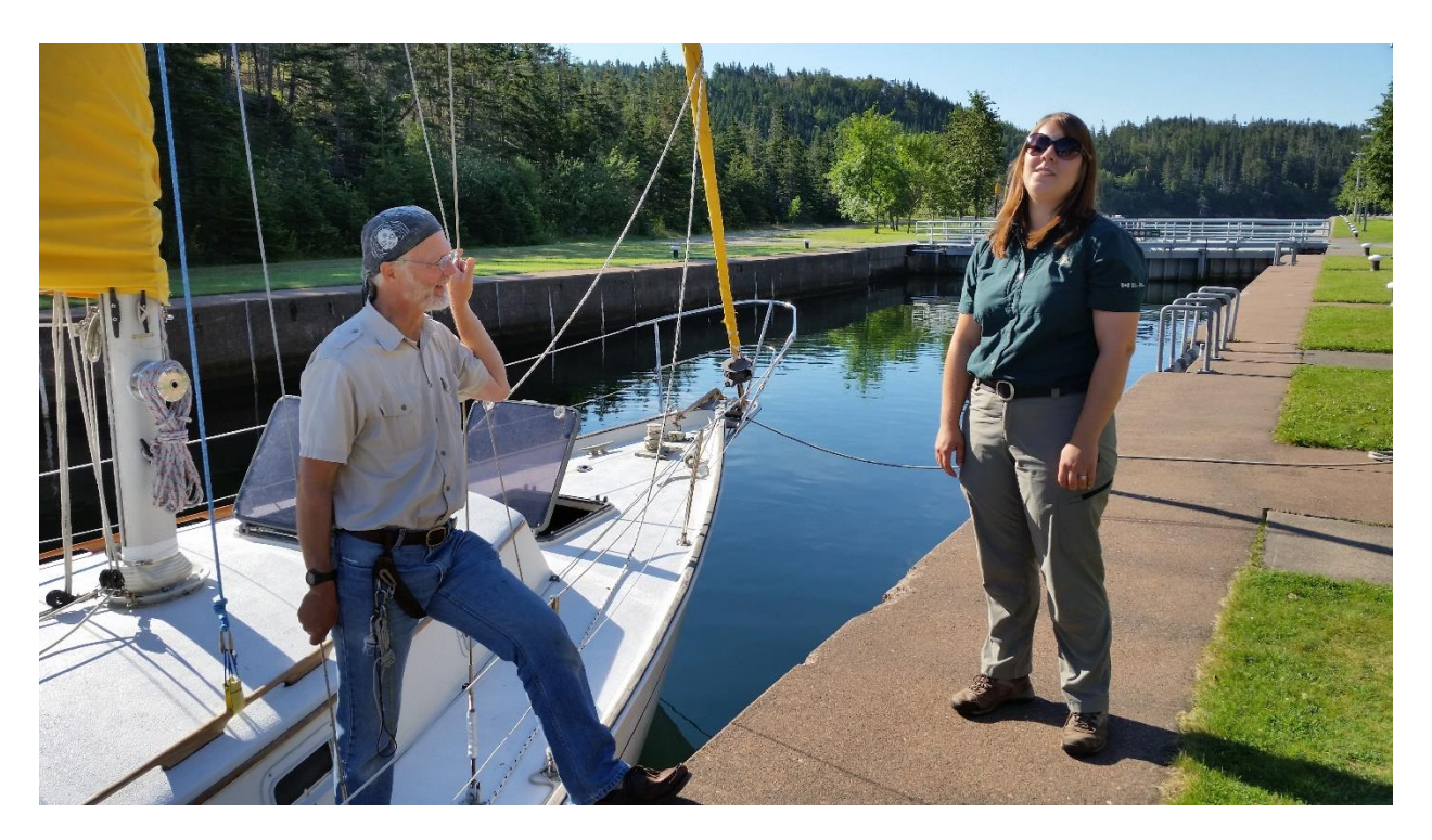
Locking through at St. Peters Canal.