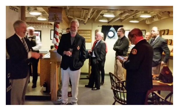
Cocktail and socializing time on board prior to dinner, 2015.