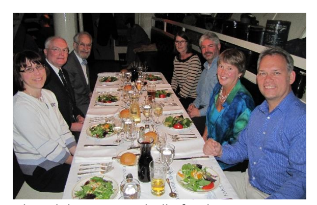
Aboard the HMCS Sackville for the Instructors Dinner, May 2011.

Each spring the Halifax Squadron of CPS-ECP thanks and honours its instructors with a dinner. Most years, this dinner is held onboard the HMCS Sackville , the second oldest commissioned vessel in the Royal Canadian Navy. The dinner is a chance to say "Thanks" to the many instructors who contribute their time for teaching and mentoring. The raison d'être of our Squadron and CPS-ECP in general is to help boaters learn about navigation, operations, and safety. Our instructors are at the forefront of this focus. I have attached photos from past dinners.