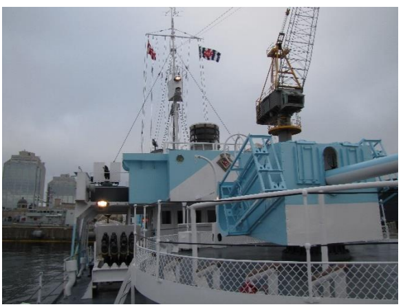
The Sackville flys the CPS-ECP flag.